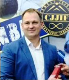
VLADYSLAV SHYPINSKYI PRESIDENT CJJIF – Combat Ju-Jutsu International Federation CJJ INTERNATIONAL FEDERATION 8 th Black belt CJJ